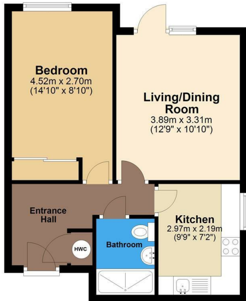
Floor Plan Approx. 42.1 sq. metres (453.2 sq. feet)

Total area: approx. 42.1 sq. metres (453.2 sq. feet)